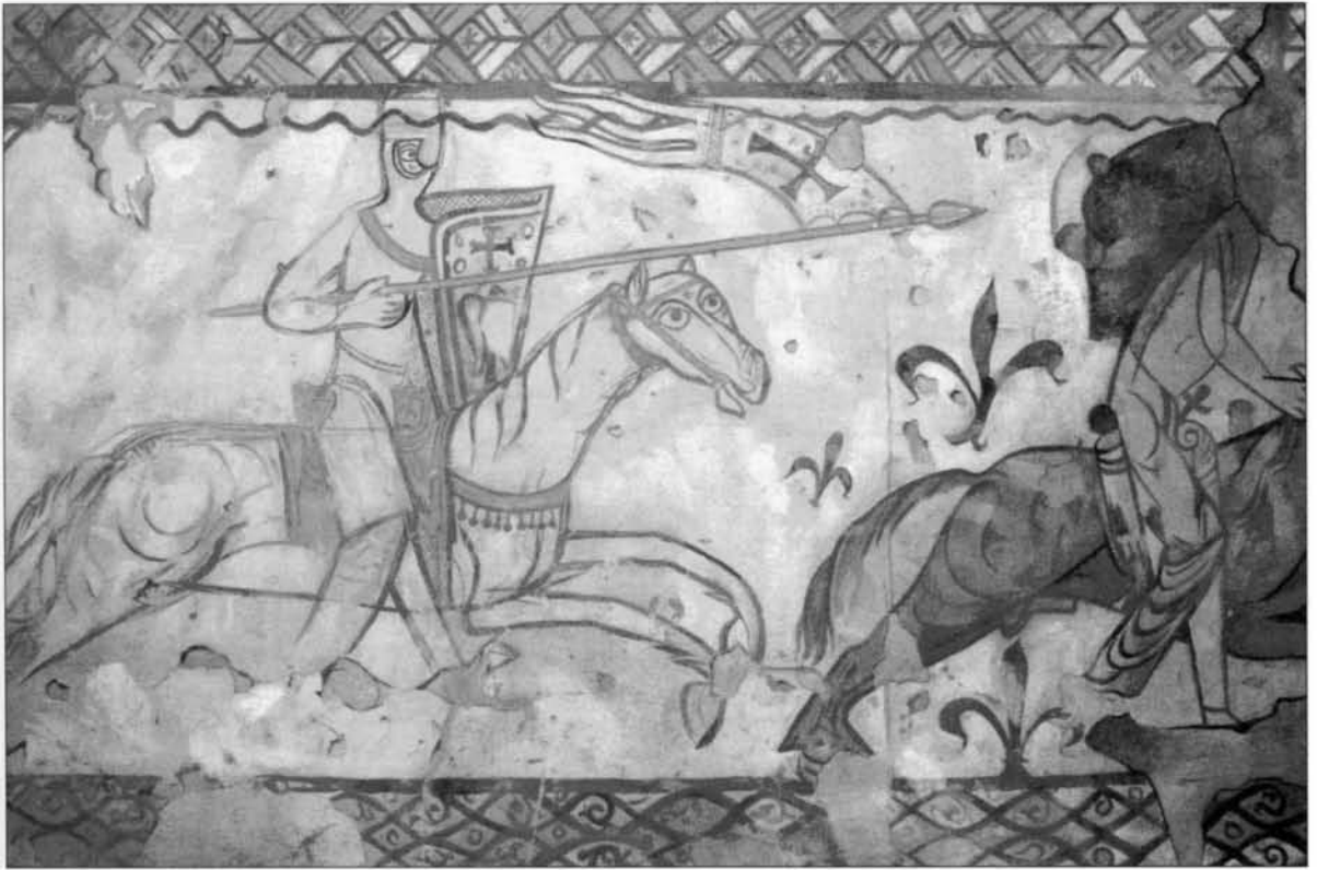
ABOVE A copy of the wall paintings in the Templar church at Cressac, made before they were damaged during the Second World War. Here a Crusader pursues a Saracen.